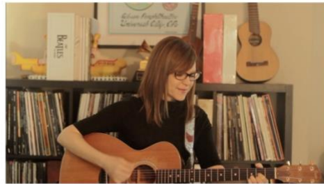
Lisa Loeb performed her songs, "Stay" and "Sing Out".

We also received beautiful butterfly art submissions from students in the local area!