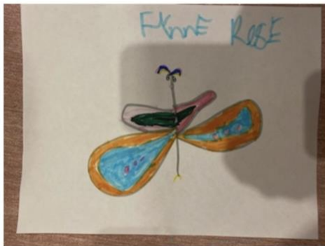
Fynne Rose, Grade 1, Los Angeles

We also received beautiful butterfly art submissions from students in the local area!