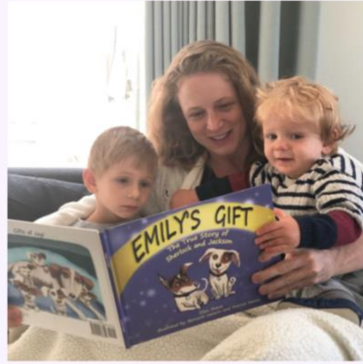
Children enjoying reading Emily's Gift .