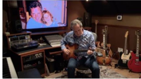
Les Sabler performed smooth jazz.