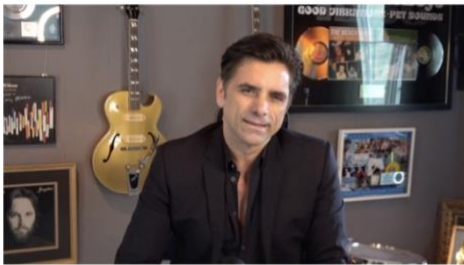
John Stamos spoke at the event.