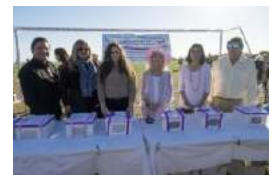
Some of the honorees who helped in the release of the butterflies.

To all who came out to join us and who sponsored butterflies or contributed in any way - we express our deepest gratitude! (Please see a complete list on the final page of this newsletter)