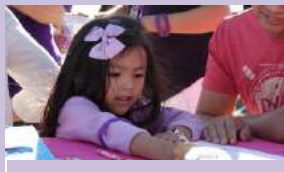
A young girl enjoying the crafts table at the event.