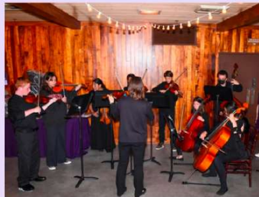
Malibu Middle School performing at WOM 2023

We want to express appreciation to our event sponsors and donors who made Wings Over Malibu 2023 possible. This event would not have been a success without their participation! We would also like to express our gratitude to everyone who participated in our auctions and to all who so generously donated in support of our SEA Program. It is because of you that we can pursue our mission of making a difference in the lives of the students we serve.