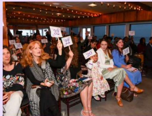
WOM 2023 Live Auction