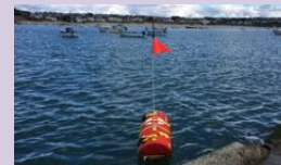
At Audierne, which is a commune in the Finistère department of Brittany in Northwestern France.

The E.M.I.L.L.Y. has been in Brest, France working on merging a new partnership with Ifremer, a French institute that undertakes research and expert assessments to advance knowledge on the oceans and their resources, monitors the marine environment and fosters the sustainable development of maritime activities. The Ifremer's new water sampling system is placed within E.M.I.L.L.Y. to collect water for their research.