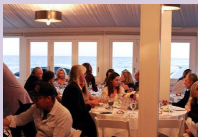
The ambiance of The Sunset Restaurant is truly unmatched.