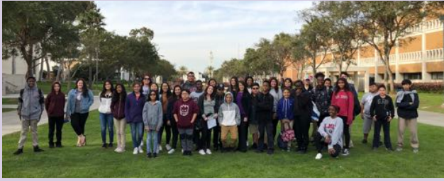
Group photo at the SEA Program's field trip to LMU!