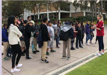
The LMU student tour guide shared a wealth of information.