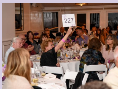
The Live Auction in action!