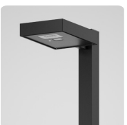
SCL2 3680 Lumen