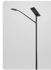
BFL Roadway Lighting System 7220 Lumen