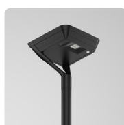
IPL 1550 Lumen