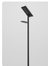
BFL Area Lighting System 7220 Lumen