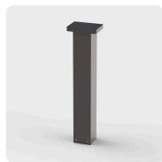
Vega Design Forward Bollard 540 Lumen