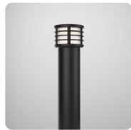
WLB Omni- Directional Bollard 130Lumen