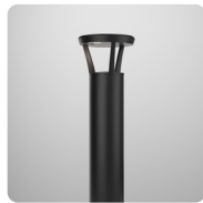
PLB Pathway and Way-finding Bollard 450 Lumen