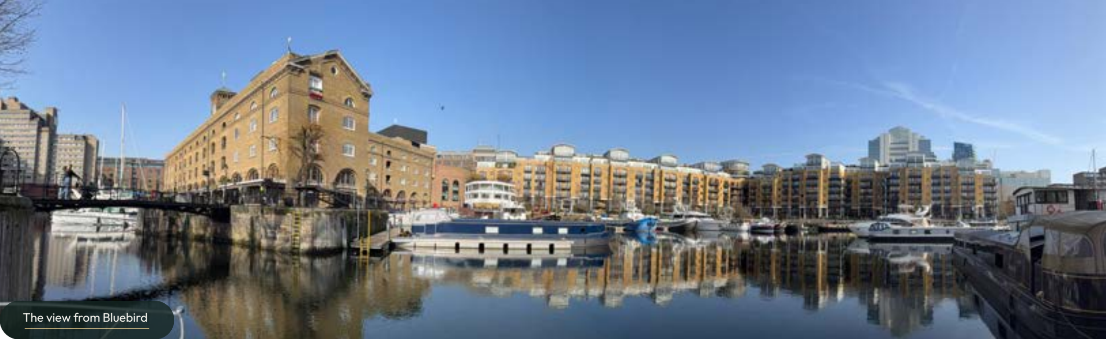
The view from Bluebird