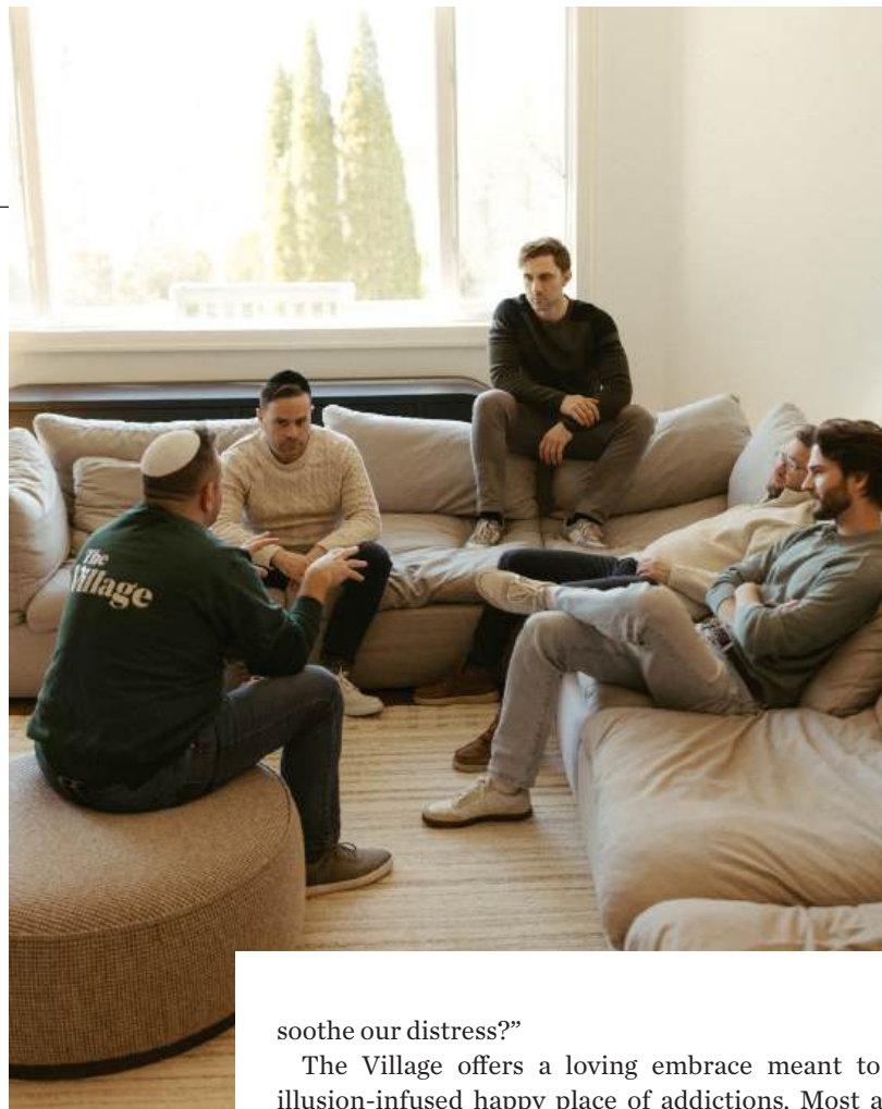
Some former clients at The Village are sure it was the love and acceptance they found there that turned their life around

Addicts, Sony says, have actually figured out a way to deal with the painful places of life. “They found some kind of solution that gets them to a place where they’re happier. Mostly, they’re just extreme versions of the rest of us. Everyone has some anxiety or depression, but it’s not a disorder until you can’t function without your drug of choice — but don’t all of us do things to