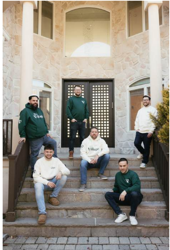
The Village offers a loving embrace meant to replace that illusion-infused happy place of addictions: “We’re going to love you till you love yourself”

It's a bit shocking that there is such a need, yet Sony says there's demand for even more