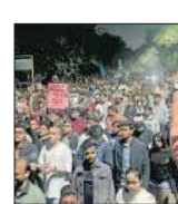
Students march at the campus.

The protest followed a JNUSU statement on Friday demanding the VC's resignation over what it called "blatantly casteist statements" made during a media interview published last week. The media out-