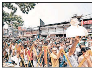
Large crowd gathers during a corner meeting by Lok Sabha LoP Rahul Gandhi in Adoor, Pathanamthitta, on Monday.

"Narendra Modi listens to Donald Trump, and Pinarayi Vijayan listens to Narendra