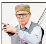
OM Omar Abdullah in the J&K Assembly in Jammu, Monday.

The Bill will expose the NC's lack of clarity on the issue, with president Ferooz Abdullah taking a stand contrary to that taken by a party in the past, in terming Mufti's demand for divisional status for Pir Panjal and Chenab