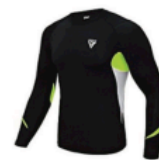
COLOUR PATTERN SHOWING