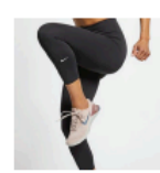
LOGO DISPLAYED IF LESS THAN 1CM X 2CM IN SIZE