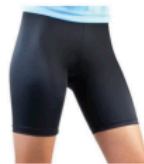
COMPRESSION BIKE SHORT