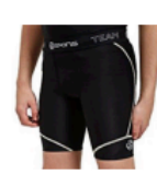
UNDER SHORTS WITH PATTERN SHOWING