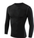
COMPRESSION LONG SLEEVE