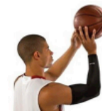
COMPRESSION ARM SLEEVE