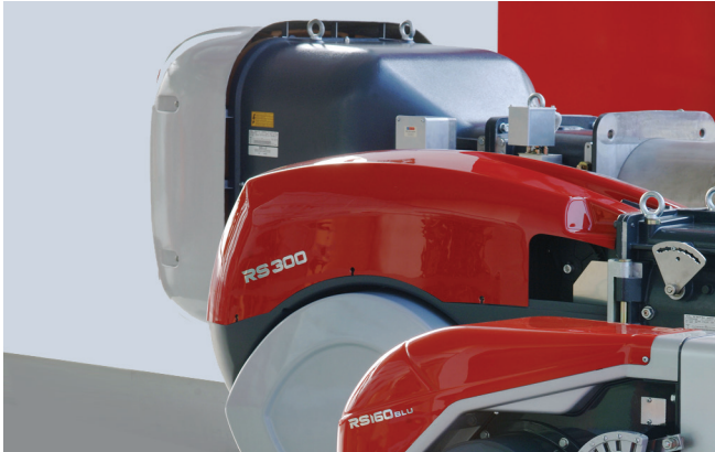
State-of-the art Riello burners