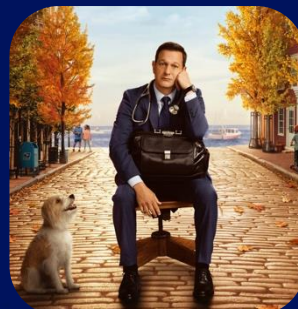
Best Medicine (r)