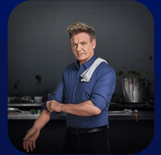
Kitchen Nightmares (r)