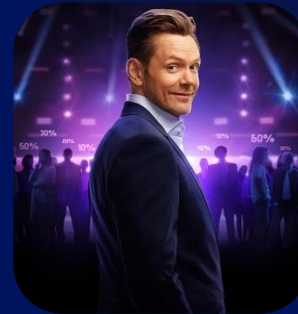
The 1% Club (r)