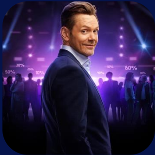
The 1% Club