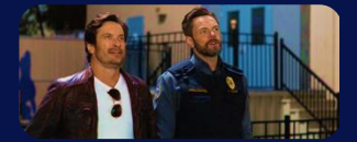
Animal Control (r)