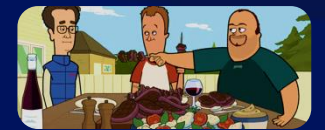
Universal Basic Guys (r)