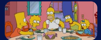
The Simpsons (r)