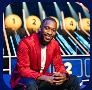
The Quiz with Balls