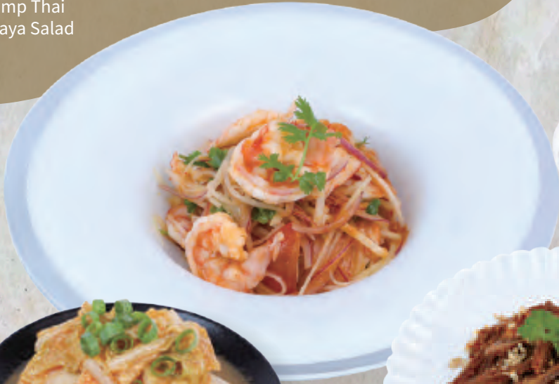
Shrimp Thai Papaya Salad