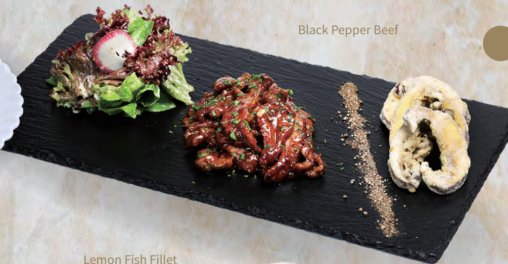
Black Pepper Beef