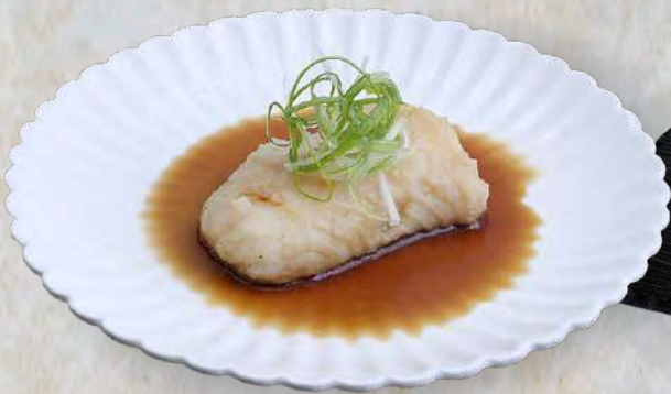
Steamed Fish Fillet