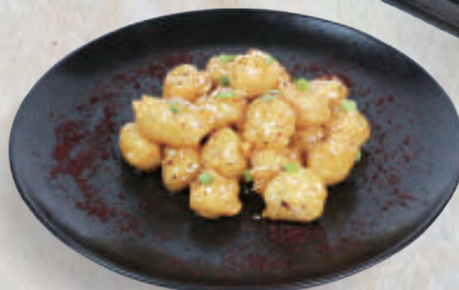
Mango Citrus Chicken