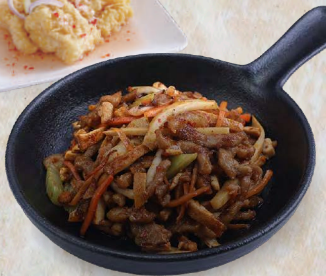
Hakka Stir Fried Noodles

M5 ROASTED VEG WITH SESAME DRESSING 鹽烤蔬菜佐芝麻風味醬