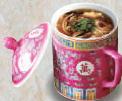
Hot and Sour Soup