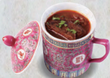
Braised Beef Soup