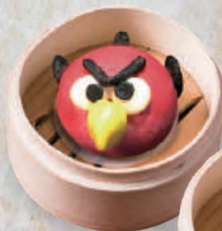
Angry Bird Chili Sweet Potato