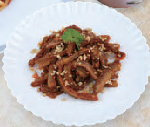
Szechuan Beef Tripe