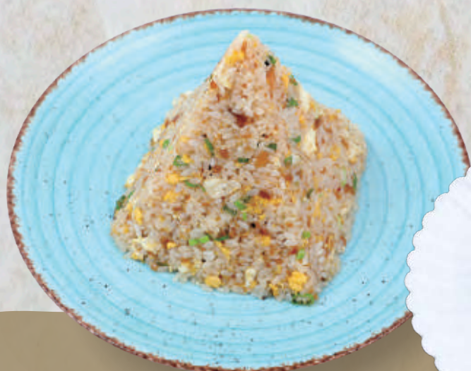
Garlic Fried Rice

Chinese rice with deep fried garlic, fish sauce, dry shrimp paste, soya beans.