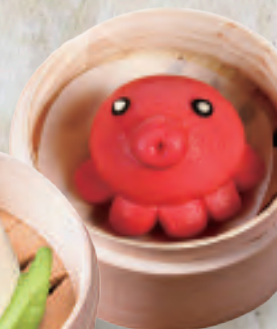
Octopus Sweet Potato