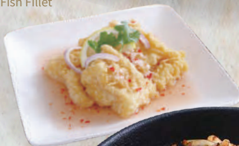
Lemon Fish Fillet