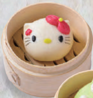
Hello Kitty Cream Custard Bao