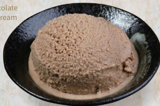
Chocolate Ice Cream