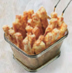
Fried Fish Sticks