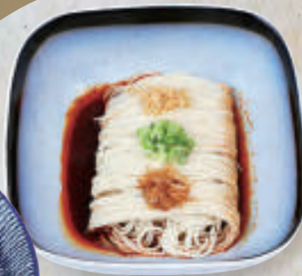
Szechuan Spicy Noodles