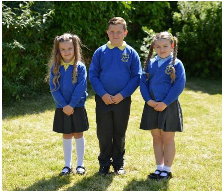
Example of summer uniform