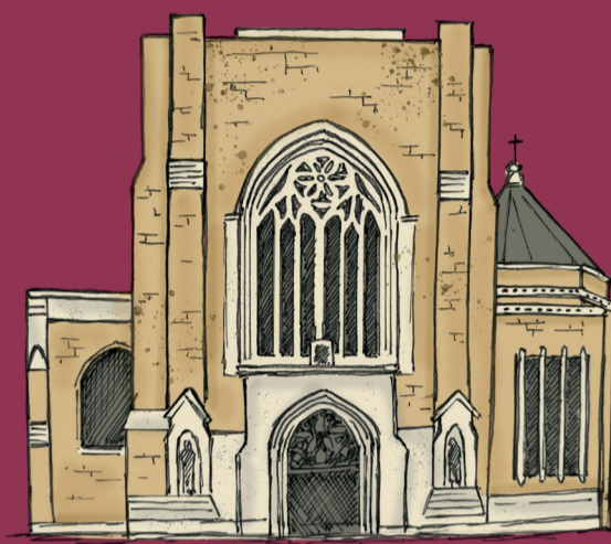
St George's Cathedral

For delegates from the Dioceses of England and Wales