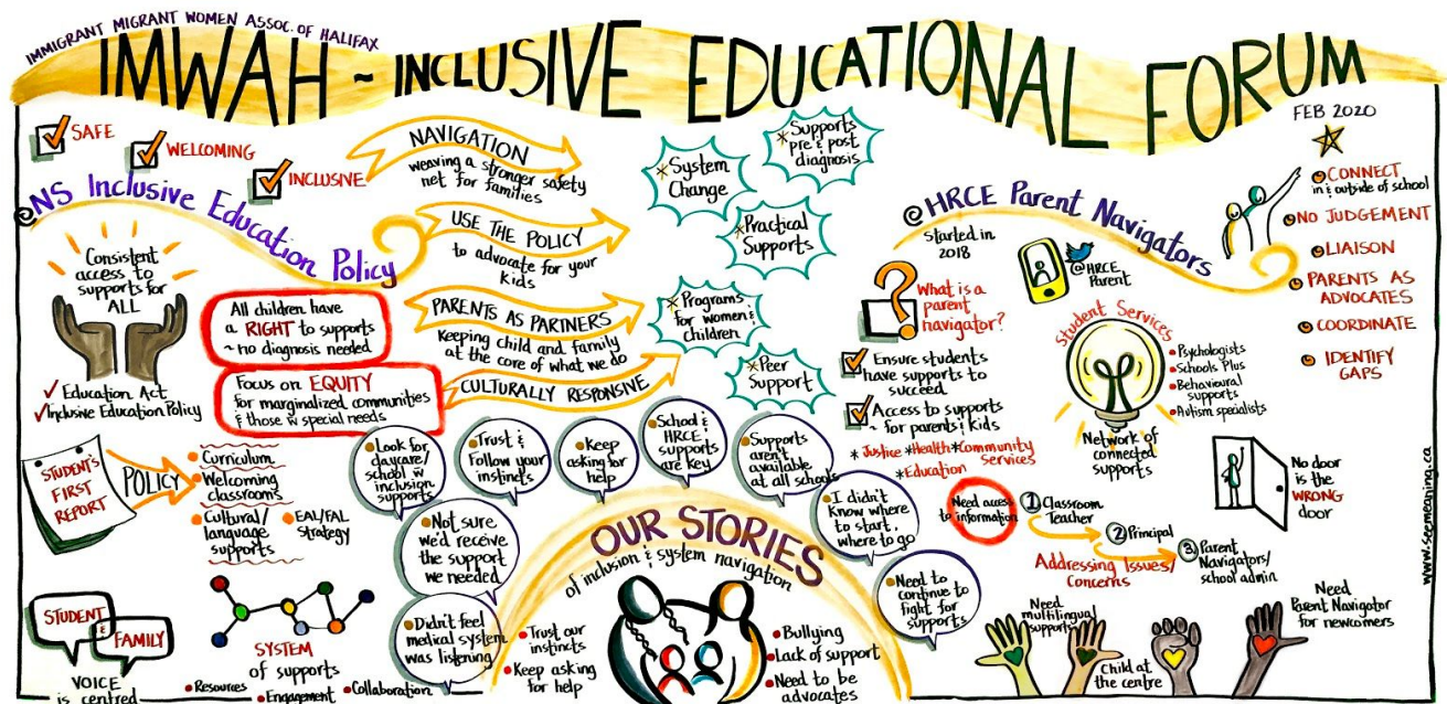
Graphic Facilitation 1 of 2 at IEF produced by See Meaning, February 8th, 2020.