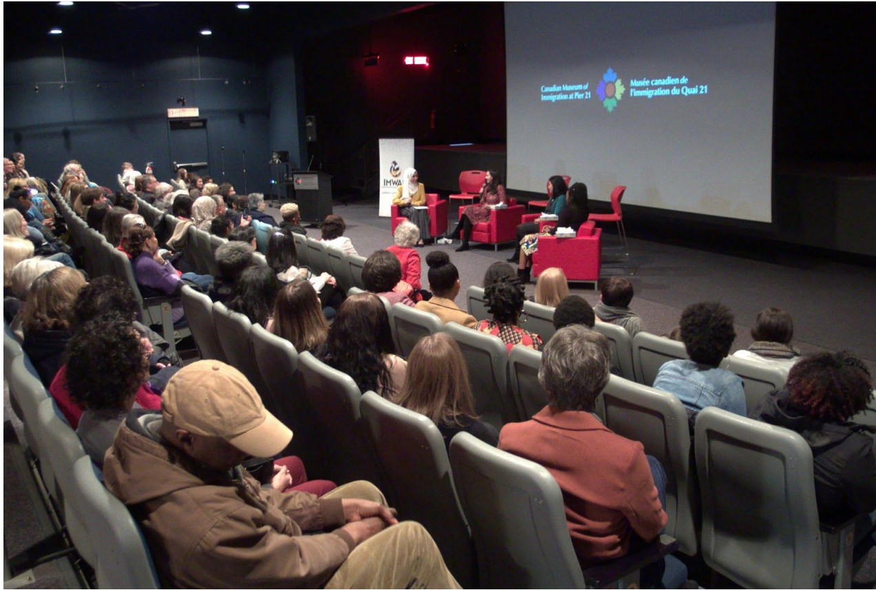
Panel Discussion, Oral History Project “My Mother and I: Our Journey”, Canadian Museum of Immigration at Pier 21

We welcome any women, youth and girls who are first and second generation immigrants and migrants residing in HRM and in Nova Scotia to keep in touch with us. In our upcoming strategic planning, we aim to refine our membership definition and create a membership structure to better connect and meet your needs.