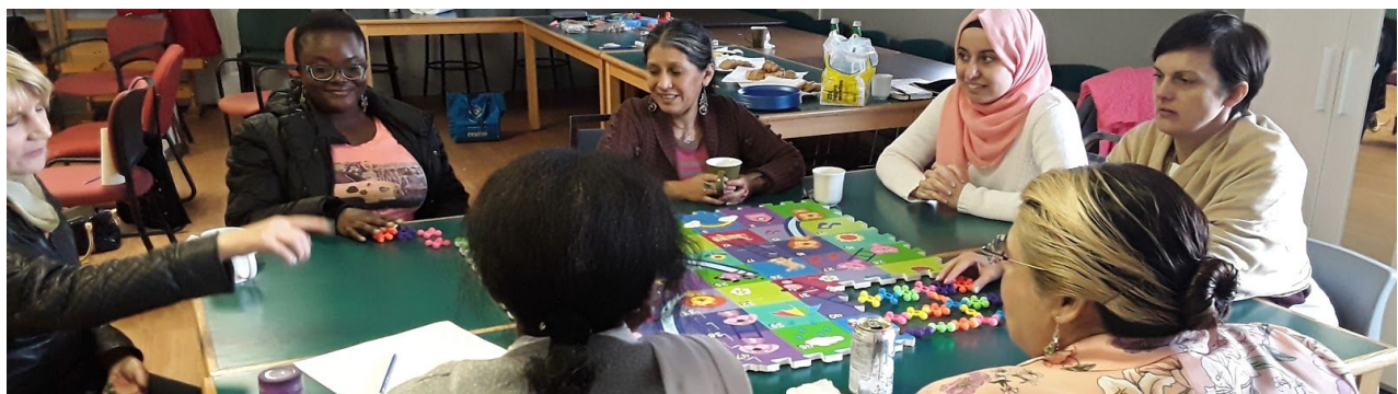
Intercultural Communication Workshop, October 2019

Thank-you to WAGE for their recognition and continued support!