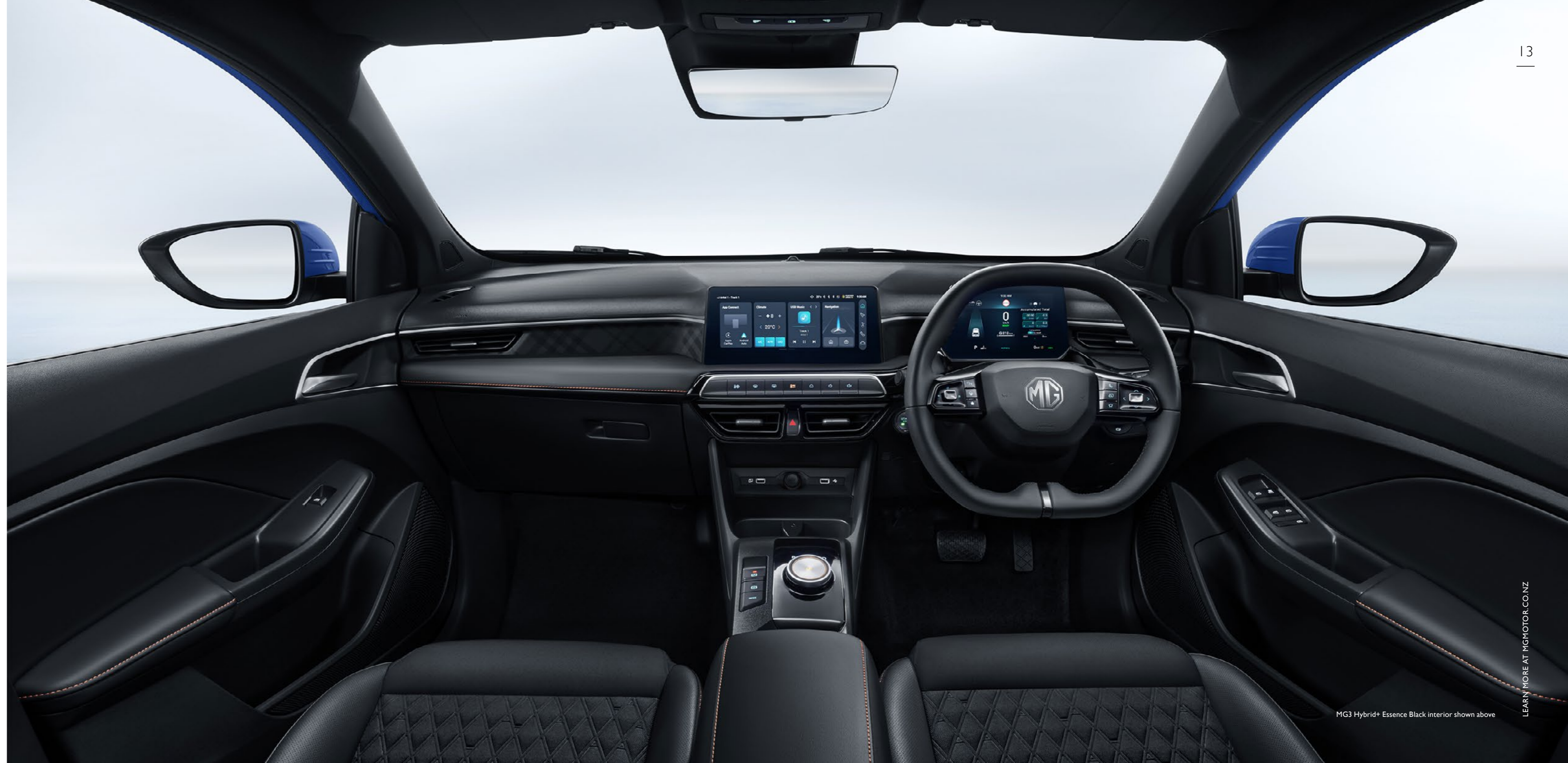
MG3 Hybrid+ Essence Black interior shown above