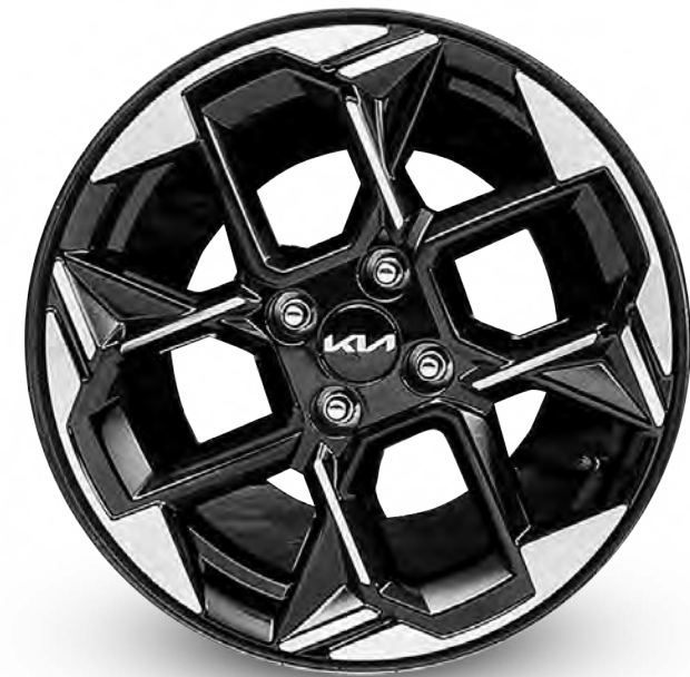
16" alloy (GT-Line)