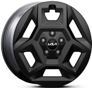
17" Alloy (EX)