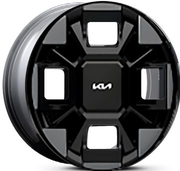
19" Alloy (Water HEV)