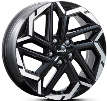
18" Alloy Machine Finished (Deluxe)