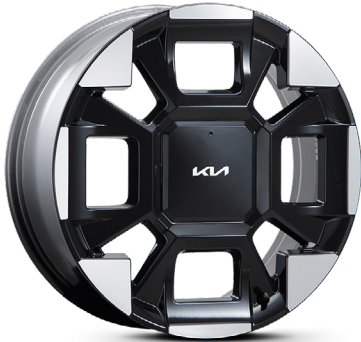
19" Alloy Machine Finished (Premium)