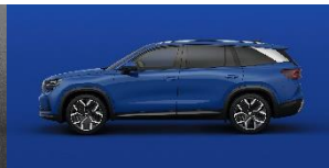
Energy Blue Uni