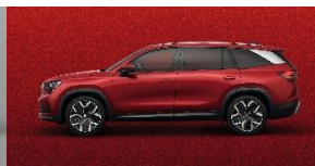
Velvet Red Metallic (+$1,000)