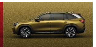
Bronx Gold Metallic