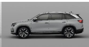
Steel Grey Uni