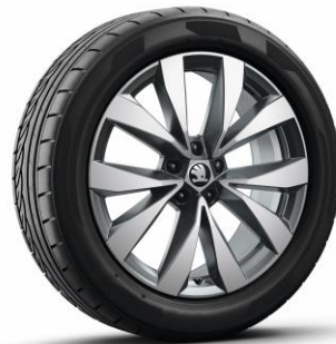
19" 'Lefka' anthracite alloy

Škoda reserves the right to make changes to specifications, colours and prices without notice. Whilst we make every effort to ensure that specifications are accurate at the time of publication, you should always check with your Škoda dealer for the latest information.