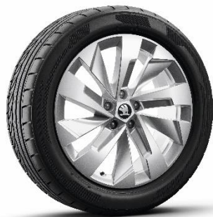
19" Rapeto polished silver alloy