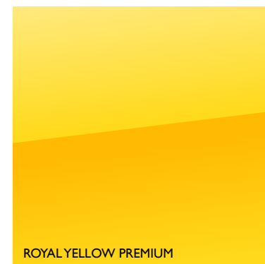
ROYAL YELLOW PREMIUM