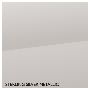
STERLING SILVER METALLIC