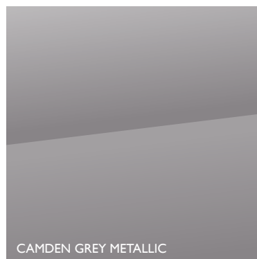
CAMDEN GREY METALLIC