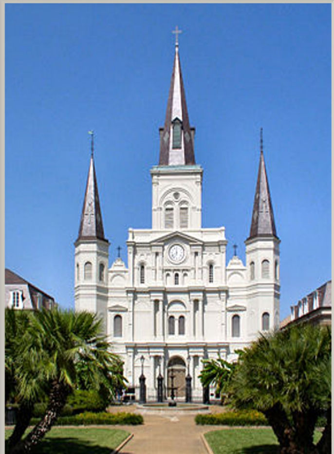
St. Louis Cathedral, New Orleans