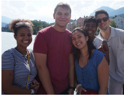
The bridge over the river Inn, on which these students are standing, gives Innsbruck its name and history.