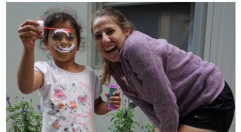
One of the community outreach opportunities is to visit a refugee home in Innsbruck and entertain the kids with an afternoon of games, while learning about the local refugee situation.