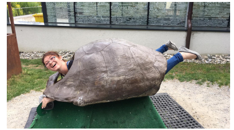
The program offers a wide range of extracurricular afternoon activities, such as a visit to Innsbruck's Alpine Zoo.