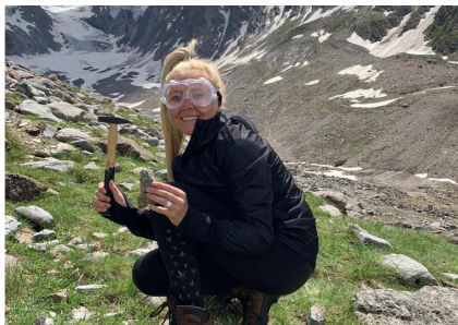
On a class field trip to a nearby glacier, students learn about Alpine geology and environmental concerns.