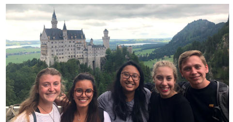
The many field trips on this program allow students to learn more about Innsbruck and its surroundings. Here students visit Neuschwanstein Castle in nearby Bavaria.