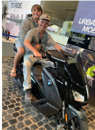
Some of the Business classes take a field trip to the BMW Factory in Munich.