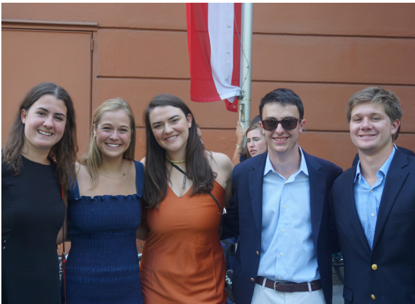
The Opening Ceremony is one of the highlights of the program for many students. It is a great opportunity to make new friends!

Students can apply their financial aid towards UM study abroad programs, including this one. All students should review the study abroad information on the University of Mississippi Financial Aid Office website. It is the student's responsibility to meet with a UM financial aid advisor to discuss how aid packages apply to study abroad. Third party scholarships may also be available for specific programs, so students should discuss study abroad early and often with the Study Abroad Office and the Financial Aid Office.