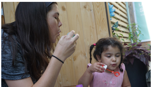
One of the community outreach projects is to visit a refugee home in Innsbruck and entertain the kids with some games, while learning about the local refugee situation.