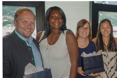
Our Global Ambassadors represent the program at special events, such as a meeting and Q&A session with Innsbruck City Council Members.

"Being an Ambassador made the experience even better and I recommend applying for it! Thank you so much for an experience I will carry for a lifetime. I seriously had the summer of my life!"