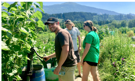
Social Engagement opportunities allow students to have a more immersive experience and gain volunteer service hours, such as in this community garden.