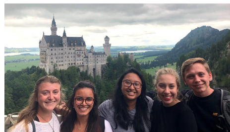
The many field trips on this program allow students to learn more about Innsbruck and its surroundings. Here students visit Neuschwanstein Castle in nearby Bavaria.