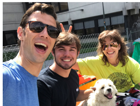
The Buddy Program, an opportunity to meet local students, is a very popular part of our program in Innsbruck.