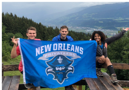
The program offers many field trips and activities with opportunities to hike the mountains around Innsbruck.