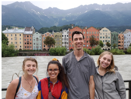
Walking along the Inn river with a view of the Alps becomes a daily routine while studying in Innsbruck.