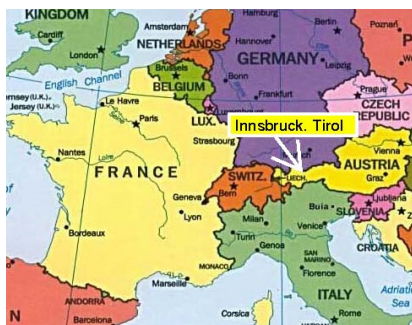
Innsbruck's central location in Europe allows for easy travel on long, free weekends.