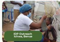
IDP Outreach Ichwa, Benue