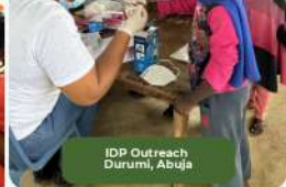
IDP Outreach Durumi, Abuja