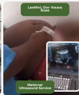
Maternal Ultrasound Service