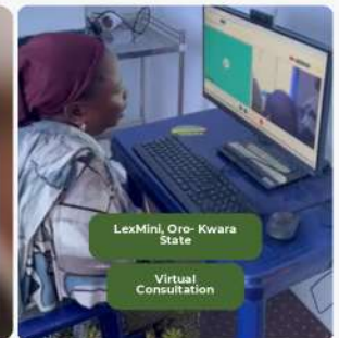
LexMini, Oro-Kwara State