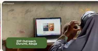
IDP Outreach Durumi, Abuja