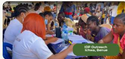
IDP Outreach Ichwa, Benue