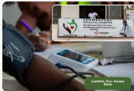
LexMini, Oro-Kwara State