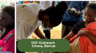
IDP Outreach Ichwa, Benue