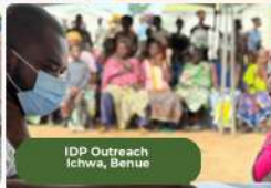
IDP Outreach Ichwa, Benue