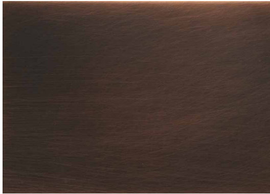
Cu 1A LM