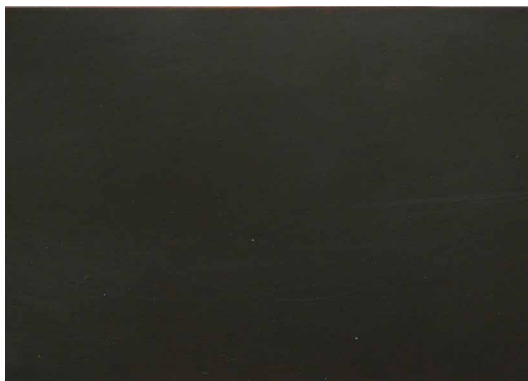
Cu 2A LM