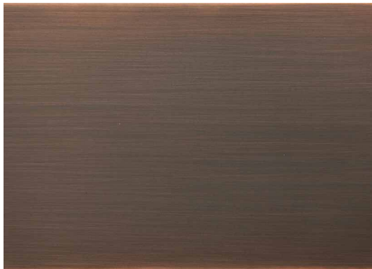
Cu 1B LM