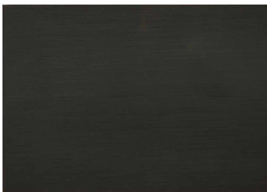
Cu 2B LM