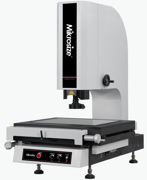
VMA Manual Video Measuring