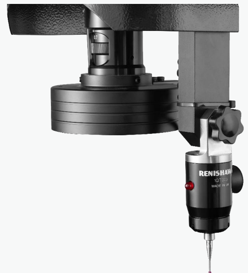
Renishaw 3D Probe