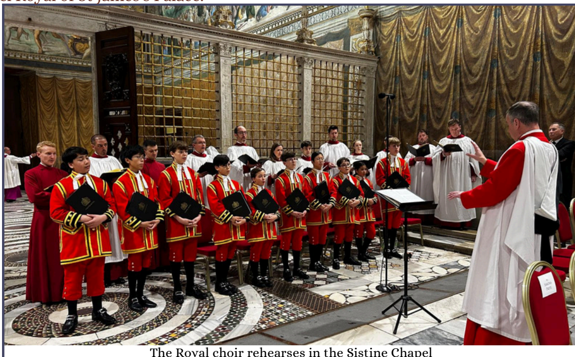
The Royal choir rehearses in the Sistine Chapel

They met Pope Leo XIV in the Vatican's Apostolic Palace before proceeding to an ecumenical service in the Sistine Chapel. The Service was led jointly by the Pope and the Archbishop of York, the Most Revd Stephen Cottrell, and included singing of the Sistine Chapel Choir, the Lay Vicars of St George's Chapel, Windsor, and the choristers of the Chapel Royal of St James's Palace.