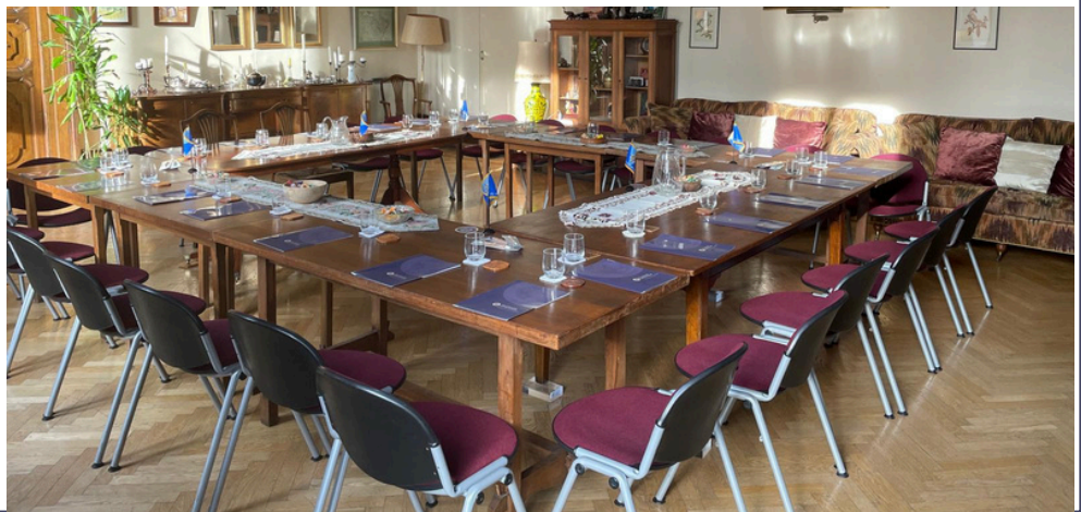
Flexible spaces: The Director's Salone rearranged for the IASCUFUO meeting