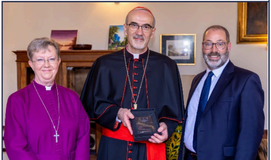
Presentation of Bridge Award 2025 to Cardinal Pizzaballa