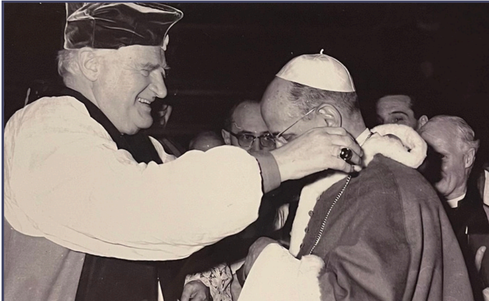
Archbishop Michael Ramsey gives Pope Paul VI a pectoral cross in March 1966

5 October 2026 will see the completion of 60 years since the Anglican Centre in Rome was inaugurated and we are preparing to celebrate that significant landmark in our work to develop friendship and deepen mutual understanding between Anglicans and Roman Catholics and pursuit of the vision of Christian unity. For six decades we have been a place of encounter, learning and hospitality in the Eternal City, resourcing learning and collaboration alongside the promotion of ecumenical dialogue. The Centre has welcomed pilgrims, theologians, clergy, and lay visitors from across the Anglican Communion and beyond, nurturing relationships rooted in prayer, study, and shared service. This anniversary offers an opportunity not only to give thanks for the Anglican Centre's rich history, but also to look forward with hope and imagination to its continuing vocation in a changing world.