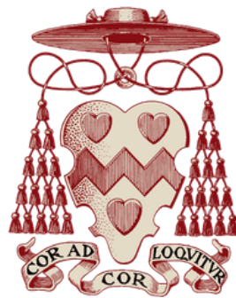
St John Henry Newman’s coat of arms with his moto “heart speaks to heart”

Newman, who wrote so powerfully about the sensus fidelium —the shared discernment of truth by clergy, and laity—now appears to be teaching the Church once again, through his writings and their reception. As Archbishop Cottrell reflects, there is here “a glimpse of the healing of division... and of the flickering light of unity that we find in Christ.” Joy indeed. Not only for the recognition of a great theologian, but for the hope that, even amid the gloom of a fractured world, the Church may still be gently led toward unity: Lead thou us on.