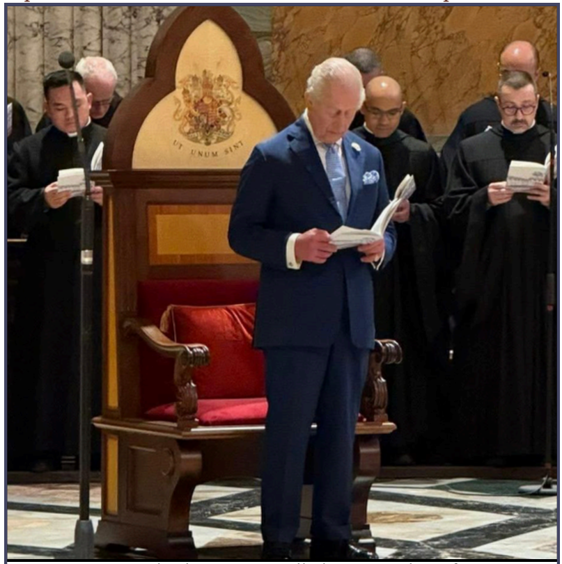
HM King Charles III is installed as a Royal Confrater

In recognition of these developments, and of His Majesty’s longstanding commitment to Christian unity, the visit was marked by a distinctive and enduring sign. Cardinal Harvey explained the decision to confer upon the King a historic title, renewed for the present day: “Desiring to re-establish the historic bond between Your Majesty’s kingdom and this place in a manner that is appropriate for the present day, the Abbot of the Benedictine community and I therefore proposed to confer the title of Royal Confrater on Your Majesty.”