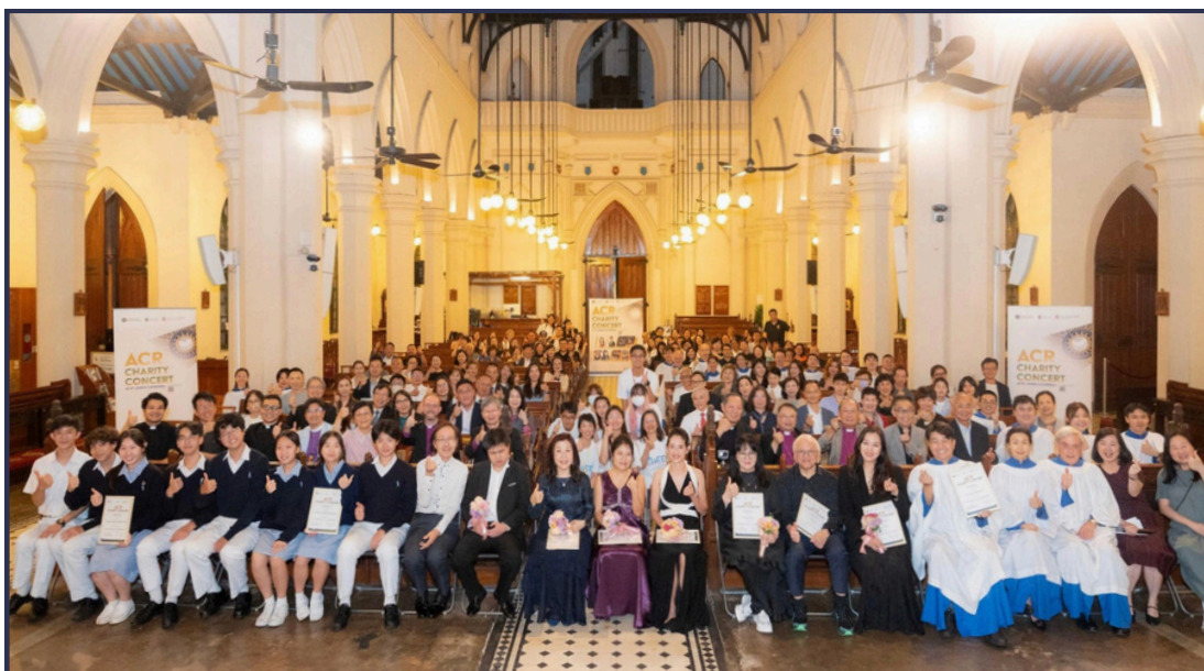
Group photo of all the guests at the concert in St John's Cathedral